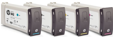
8 (2 x 775-ml per color with auto-switch)